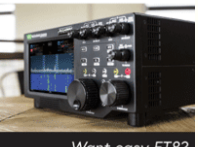
Want easy FT8? Click to learn more.